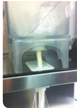
Rubber dispenser nozzle exit point