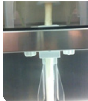
Easy to use durable plastic push lever