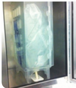
Toughened plastic casing for milk bladder