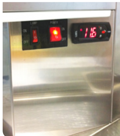
Front panel light on/off switch