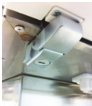
Stainless steel keyed door lock