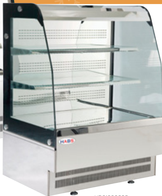
HBS1000CCO Open cold display.

HABS new line of curved glass HOT and OPEN displays. Cabinets are designed with a top mounted fan assisted cross fin coil to ensure even and gentle air flow throughout the cabinet. Fitted with LED lighting on all shelves, adjustable flat or angled shelves with black plastic coated wire shelves double glazed. The hot cabinet is fitted with a humidifier to control moisture.