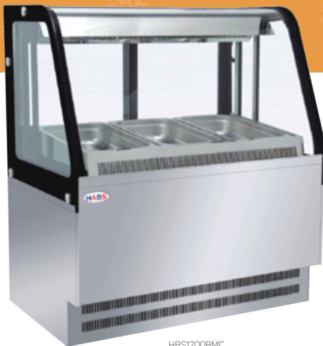
HBS1200BMC Cold Bain Marie.

HABS new line of curved glass Bain Marie displays. Cabinets are designed with a top mounted fan assisted cross fin coil to ensure even and gentle air flow throughout the cabinet. Fitted with LED lighting. Cabinets are designed to fit 1 x 1 Gastronorm trays. Fitted with double-glazed rear sliding doors. 304 Stainless steel finish.