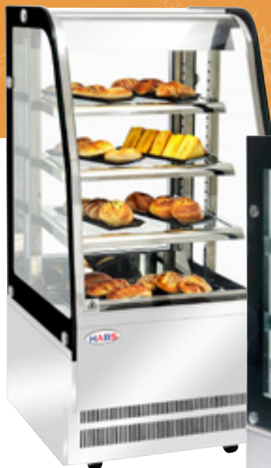
HBS660CH Shown here in stainless steel and glass shelves. Humidifier +70 deg.