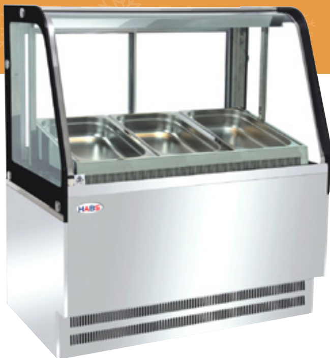
HBS1200BMH Hot Bain Marie.

HABS new line of curved glass HOT Bain Marie displays. Fitted with LED lighting. Cabinets are designed to fit 1 x 1 Gastronorm trays. Fitted with double-glazed rear sliding doors. 304 Stainless steel finish.