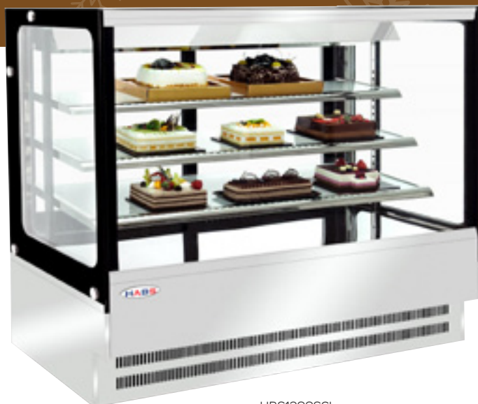
HBS1200SCL Shown here in with three levels of shelves. Standard is two levels. (Note: cabinet is 1200mm high)

HABS new line of low square glass COLD displays. Cabinets are designed with a top mounted fan assisted cross fin coil to ensure even and gentle air flow throughout the cabinet. Fitted with LED lighting on all shelves, adjustable flat or angled shelves with black plastic coated wire shelves Double glazed heated glass to control condensation. The cooling system is designed to direct hot air towards the rear of the cabinet.