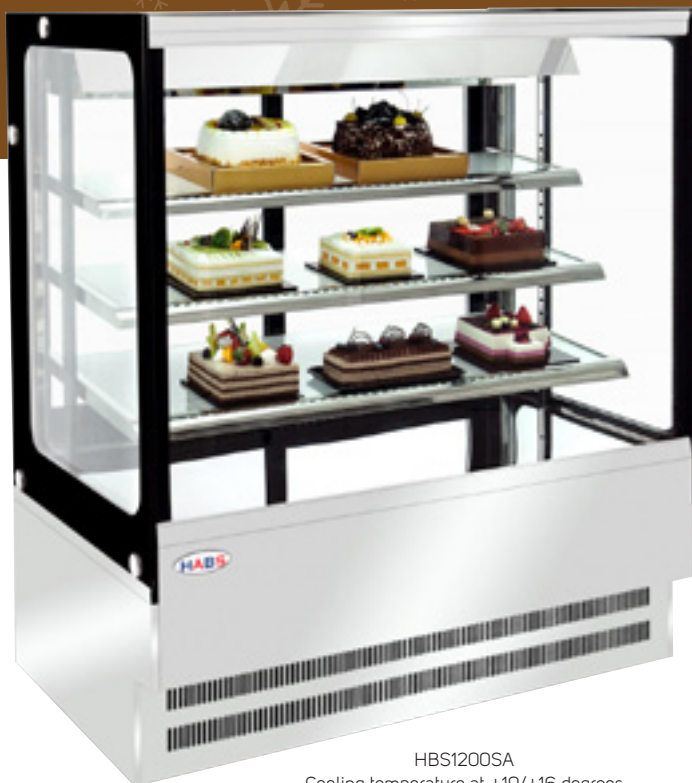
HBS1200SA Cooling temperature at +10/+16 degrees

HABS new line of square glass AMBIENT displays.