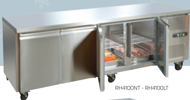
RH4100NT - RH4100LT