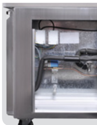
Removable side cover for ease of access to services, valves, water to tundish