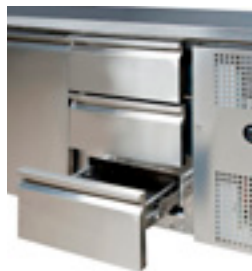
Drawer Option - 2 or 3

Rhino gastronorm refrigerator/freezer undercounters are finished in 304 stainless steel which include fan forced ducted cooling, Carel electronic controller, lockable castors, adjustable rails and wire shelves, coved internal corners, removable door seals and heated facias.