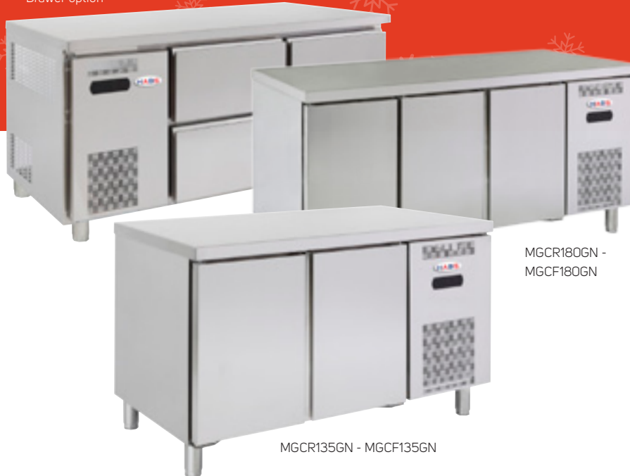
MGCR180GN - MGCF180GN