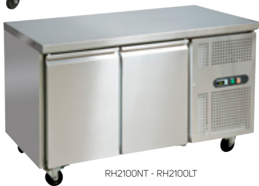
RH2100NT - RH2100LT