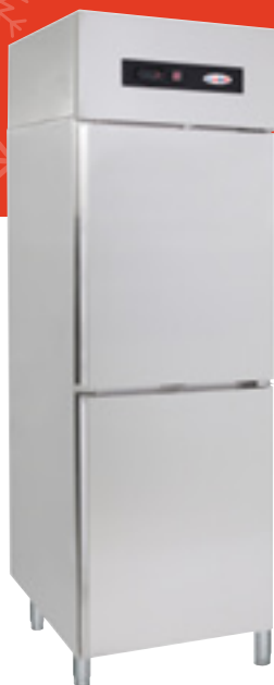
MGUR70GN - MGUF70GN

HABS gastronorm refrigerator/freezer upright cabinets are finished in 304 stainless steel and include fan forced cooling, Carel electronic controller, lockable doors and castors, adjustable rails and wire shelves, coved internal corners, interior lighting, removable door seals and heated facias. Comes standard with lockable castors overall height 2013mm high.