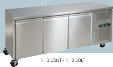
RH3100NT - RH3100LT