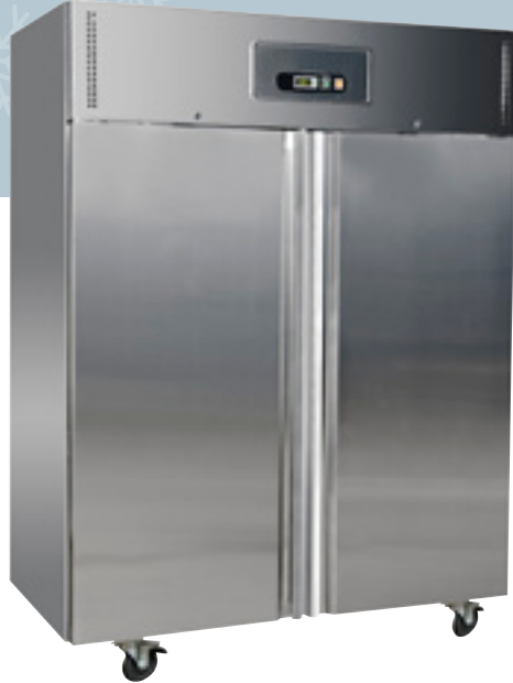
RH140NT - RH140LT

Gastronorm refrigerator/freezer upright cabinets are finished in 304 stainless steel and include fan forced cooling, Carel electronic controller, lockable doors and castors, adjustable rails and wire shelves, coved internal corners, interior lighting, removable door seals and heated facias.