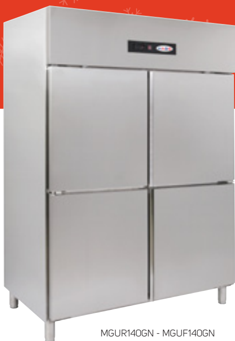
MGUR140GN - MGUF140GN