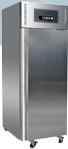
RH650NT - RH650LT